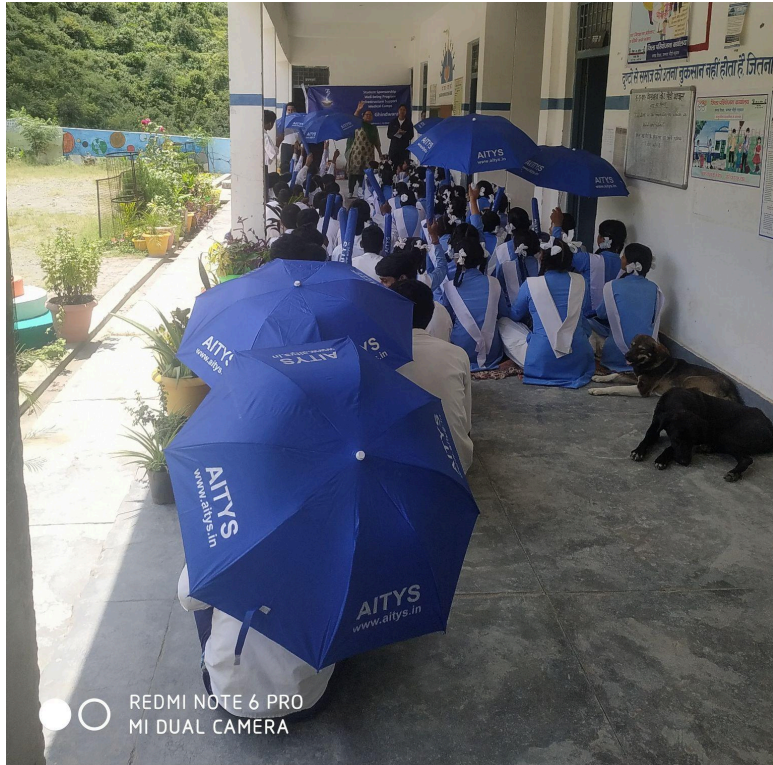
Umbrellas distributed to students and teachers in FY 22-23