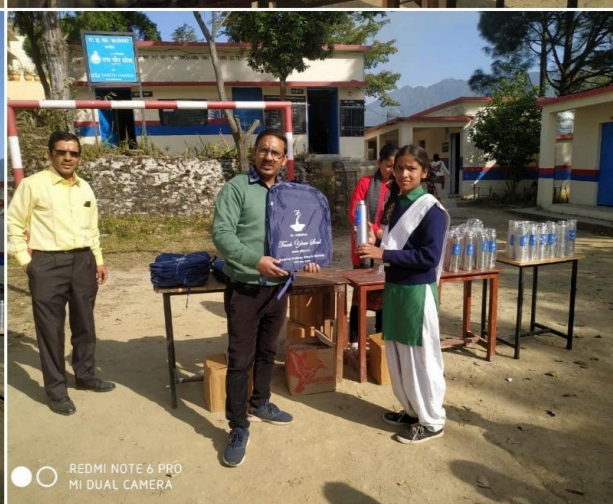
Education and well being support to students at Kaleshwar