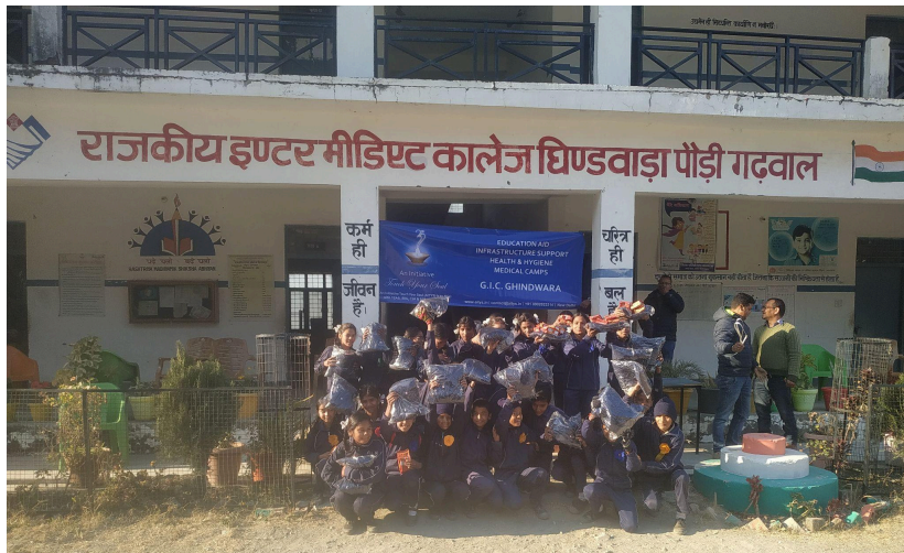
Sweaters and tracksuits sponsored in FY 22-23