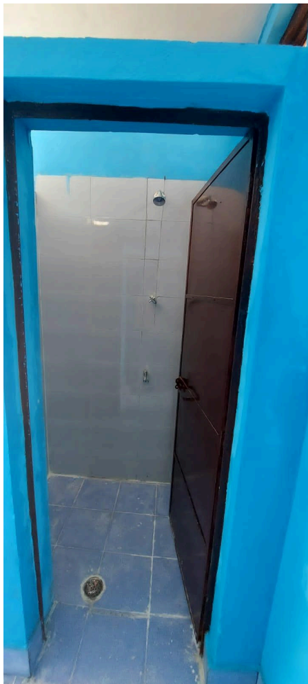
Bathroom construction at Kaleshwar